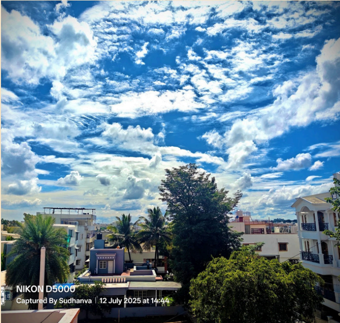
A City Breathing Under a Canvas of Clouds 12 July 2025 | Nikon D5000