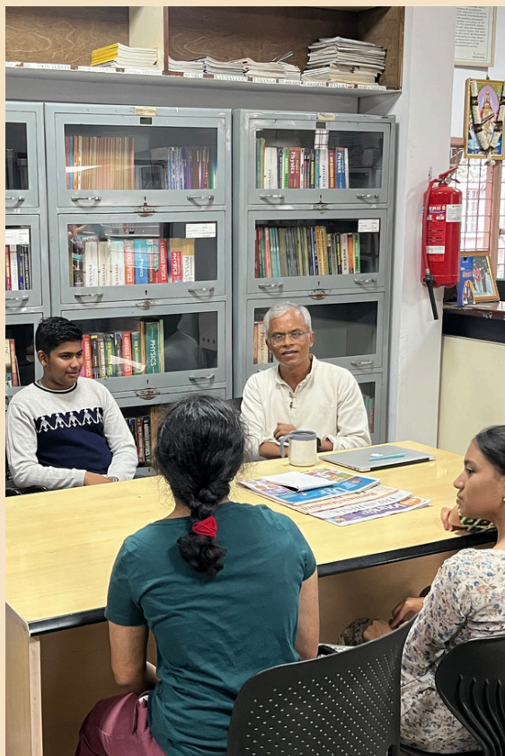
By Laya S Aekbote, PUC 1, EPPyS